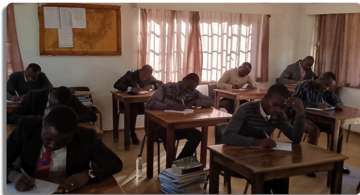
Ugandan Students in Class

Lord willing, these men will graduate near the end of September this year. Then they will return to their home areas in Uganda and resume or begin their full labors for the Lord as fully trained preachers. I am so excited about their progress and what the future holds for all of them when they return. Please keep them and their families as they continue their studies.