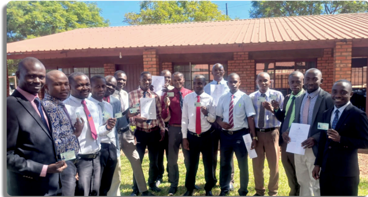
Ugandan Students in Zambia

As you may know, the students in Uganda are now in Zambia and are finishing their training as we deal with some registration issues in Uganda. Everything is going great with our students and their studies. They all seem to be thrilled to continue their studies and to get their education finished as soon as possible.