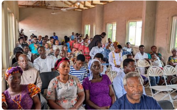
Congregation Meeting at the School Compound

It is good to be writing this report to you today from Ghana. I am currently at the school, helping to make preparations for the new students who will begin their orientation soon. It is an exciting time as we are expecting around 15 new students to join us. One of the students is from Liberia, so he will begin his journey today and hopefully will arrive by Tuesday.