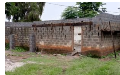
Future Church Building

Another exciting event in Ndola is the relocation of one of our teachers to a new rental house near the school. The property includes an old structure that we plan to renovate for the congregation that has been meeting at the school. The work has already begun and will cost about $3,000. If any of you are willing or able to help with this need, it would be greatly appreciated!