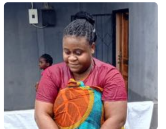
New Sister in Christ

One of the most exciting aspects of the work at GSOBS is hearing about the souls being brought to Christ. Just like our new sister in Christ pictured here, many are being added to the church by the Lord, and for that, we thank the Lord for His love, grace, and mercy!