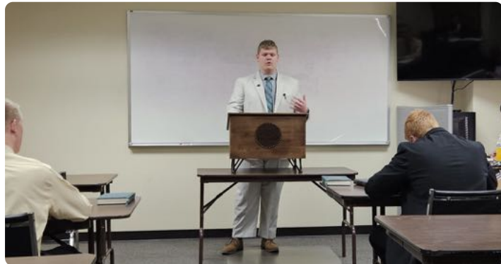
Student Preaching in Chapel

Classes have been back in session since January 6, and we are now halfway through the 3rd quarter. This quarter has been challenging so far because of sickness. We have had both students and teachers out throughout the quarter with the flu and other illnesses. Hopefully, with almost everybody having taken a turn, the rest of the quarter will be better.