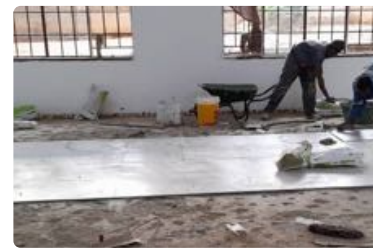
Tiling the Floor of the School

On February 10, we began a new class of students at the Zambia School of Biblical Studies. Twenty-five new students will begin their studies, so we are continuing preparations to get the facility ready and bring the students to Livingstone. Excitingly, several