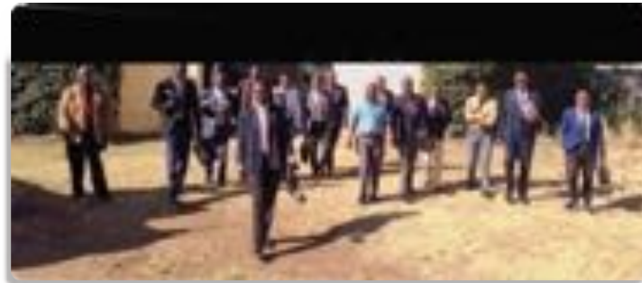
Students Traveling to Evangelize

now up for final consideration and approval. Lord willing, we will soon receive full registration as an NGO (non-governmental organization), allowing us to continue growing our work in Kenya. Please pray that we will be fruitful in this effort very soon, so we can do even more for the Lord's work in Kenya.