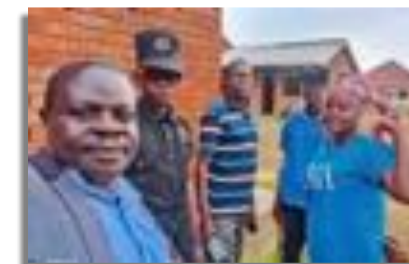
Staff at the Cleanup Day

The situation in Uganda has changed little over the past few months. We keep thinking we're going to get some resolution through the courts at any time, but things move very slowly in Africa.