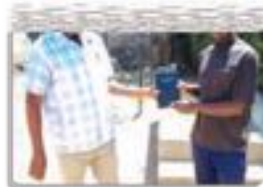
Giving the New Christian a Bible

I am also excited to share that we are still working on a new registration in Kenya. This registration would allow the Kenya School of Biblical Studies to take in students from neighboring countries. We have passed many hurdles along the way, and our registration is