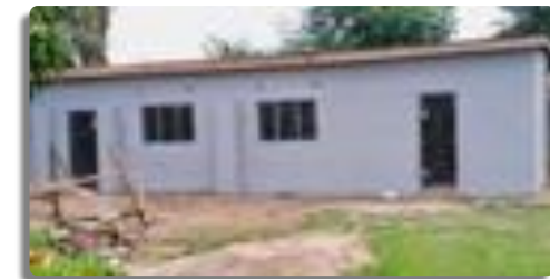
Future Church Building

You might remember in our last report I mentioned an old chicken house that we were converting into a church building for the new congregation meeting at the school. I'm happy to share that, thanks to some generous contributions,