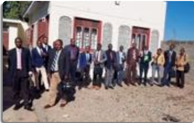
Students Leaving for Evangelism

The last few months have been busy ones in Nairobi. The faculty and students there have been hard at work in both studies and evangelism. In March, our Kenya faculty and students went out evangelizing, and 80 people were taught the gospel of Christ.