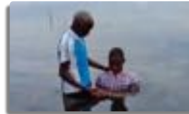
Graduate Baptizing Someone

We are also beginning to work on the idea of a full-time print ministry in Livingstone at the school. This would allow us to print tracts, books, and school materials. We hope to have this up and running within the next few months.