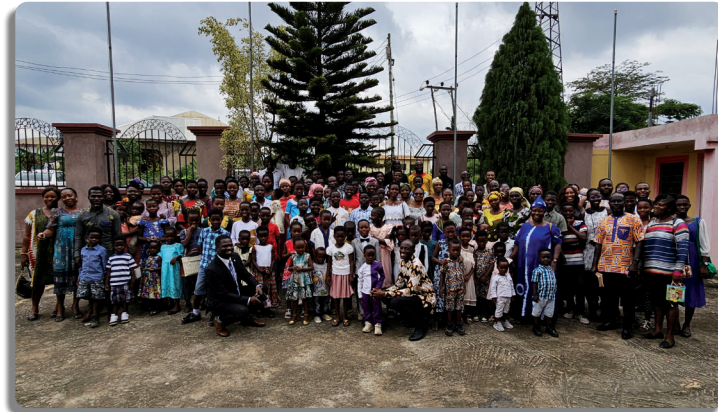
Brethren at Aboaso Church of Christ

During our stay, we visited two congregations for worship. On the first Sunday, we worshiped with the Old Tafo Church of Christ, where we were warmly welcomed by the congregation of over 400 people. On the second Sunday, we worshipped with the Aboaso Church of Christ that meets at the school's compound. The Aboaso church has about 125 members currently. Both congregations are doing well, and it was a joy to see the impact that the school's training is having on local churches.