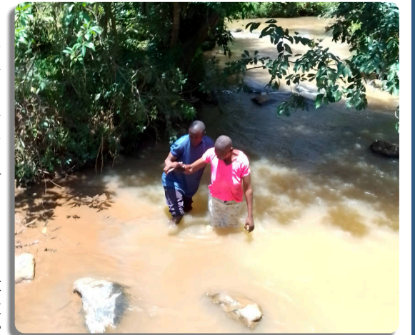
Baptism of a Man in Zambia

Our current focus is on addressing a $1,000 monthly shortfall to ensure that all our work is fully funded. Would you consider helping with this need? With full funding, we can plan for further growth and even more work for the Lord. As we know, Jesus said, "The harvest truly is plentiful," but we need more laborers. Won't you consider helping us do even more for our God?