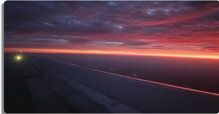
Sunrise from a Plane on Our Trip

The school in Ghana continues to operate exceptionally well, and there is a noticeable excitement among the students as they look forward to their graduation in November. The commitment and enthusiasm of these preacher students is evident in their diligent studies and desire to be equipped for the work of the Lord.