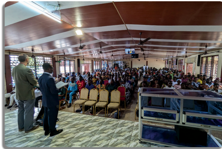
Worshipping at Old Tafo Church of Christ

Before we left, we shared a meal with the students and teachers, which was a wonderful time of fellowship and connection. The camaraderie among the students and staff is strong, and the teachers have been doing a tremendous job in training solid men who will take the gospel to the world. The students are progressing well, and we are confident they will be ready to meet the challenges of the ministry when they graduate.