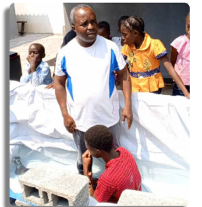
Baptism at the School