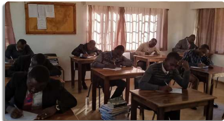
Ugandan Students in Class

Lord willing, these men will graduate near the end of September this year. Then they will return to their home areas in Uganda and resume or begin their full labors for the Lord as fully trained preachers. I am so excited about their progress and what the future holds for all of them when they return. Please keep them and their families in your prayers as they continue their studies.