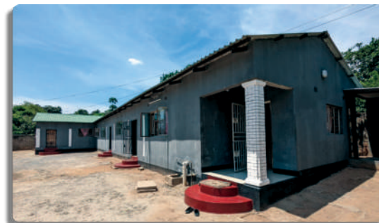
Outside of the Original Building

preparations to join us for their new course of studies.