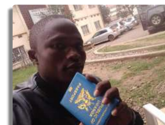
Student Holding a Passport

This month has been a busy one in Uganda. We are still working on the problems with the registration, as we have mentioned in previous newsletters. We are getting closer to a resolution, and we believe we are headed in the proper direction. Because of the delay, we have sent our current students to Zambia to complete the last seven months of their training.