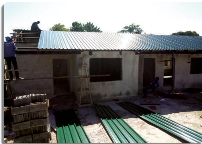
Roofing the New Building

We are planning to start with fifteen students in our first class. They Should arrive around February 11 th . Please pray for all of them as they are making