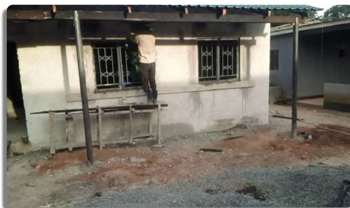
Plastering the Walls