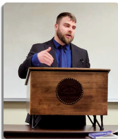
Current Students at the BIM

One of our main focuses in training men to be preachers is knowledge. Each quarter, students spend time reading the Bible, memorizing verses, reading selected commentaries, preparing sermons, writing articles and research papers, and taking quizzes and exams. Nevertheless, all this knowledge gained would still be useless unless it can be successfully passed to others through quality preaching and teaching.