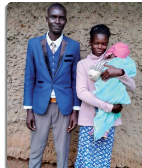
New Student of KSOBS

In our last newsletter, we told you about the yearly deficit we have. The great news is we raised around $12,000 of what we needed to cover our yearly shortage for 2024. This means that we only lack around $18,000 to make sure that our work and all our schools are fully funded for 2024. Won't you please help us cover this cost so that we may not only continue what we are doing but look for even more opportunities to serve the Lord. Thank you for your help and service to the Lord. We truly love and appreciate you all and may God richly bless us as we together strive to accomplish His perfect will.