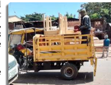
Truck Delivering Chairs

Things have been very busy in Kenya this past month as preparations are underway for the new class of eighteen men coming about the middle of February. Since we only had twelve for our first class, more beds, desks, and chairs needed to be purchased and set up.