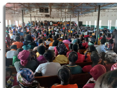
Gospel Meeting at Siamafumba

Things are very busy in Zambia as the school has had a lot of visitors from the USA over the past month. This has led to a lot of gospel meetings and lectureships which are reaching many people with the gospel of Christ. One gospel meeting was at Siamafumba, where over 3,000 souls were gathered. During the meeting, there were 122 baptisms and 132 restorations to the body of Christ. Praise be to God for all of this good work and the fruit it has born.