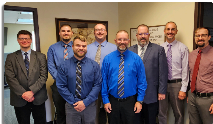
Part of the Group on Orientation Day

School is back in session! We are excited to be back in school for the 2024/2025 school year. Several alumni and supporters came to encourage our students during orientation on August 6 th . Classes then started on the following day on August 7 th .