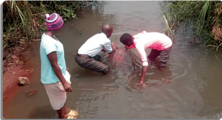
Baptism in a River in Uganda

While things are still quiet at the school in Uganda, progress is being made towards resolving the problems and finding closure. We believe we are nearing the point of regaining the land, which means we can think about restarting classes. Please pray for a positive outcome.