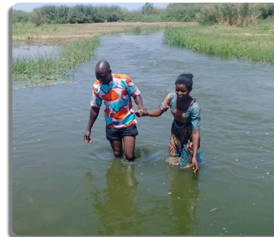
Baptism of a Woman in Uganda