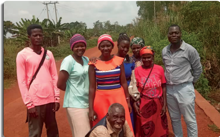
Some of Our Ugandan Brethren

As far as the Uganda class, they are doing very well in Zambia. As most of you already know, we sent our Uganda students to Zambia to finish their studies. The good news is that we will graduate our Uganda students in Zambia on September 28 th . These brothers are doing a great job and are excited about the coming graduation, so they can return home to be with their families again and get back to work in their home areas. Please keep all these Ugandan brothers in your prayers while they are in their last quarter of studies, as they prepare to graduate and head to their homes. God has certainly blessed our current Ugandan class, and I know they are going to do great things for Him in the near future.