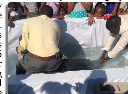
Baptism During the Gospel Meeting

A few weeks ago, there were some visitors from the USA who came to Ndola to help with a gospel meeting at the new congregation where the school meets. This congregation is only a few months old, but they had 86 people join them for the gospel meeting and 10 other local congregations were represented. There were also four baptisms.