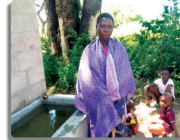
New Sister in Christ

We received exciting news when several students traveled to an area called Kasangula. After preaching there, a young woman was baptized into Christ!