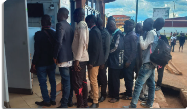
Students at Baggage Check

Zambia. Our plan is for their classes to begin in Livingstone on April 15 th , and they will graduate at the end of September. Please keep them in your prayers as they journey and continue their schooling in Livingstone.