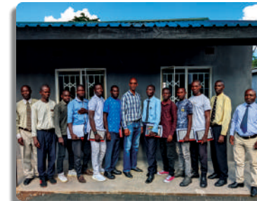
Ndola Students and Staff