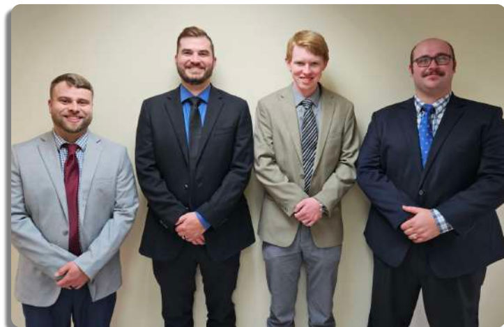
2024 Graduating Class