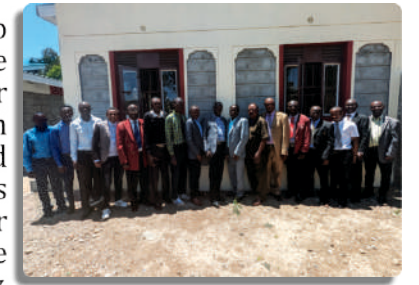
Kenya Students and Staff

We are also trying to construct one more small building on our school property in Kenya for an office and guesthouse. If there is anyone who can offer their support, we would be extremely grateful. We need about $8,000 for this project. Thank you for your prayers and support of the good work in Kenya.