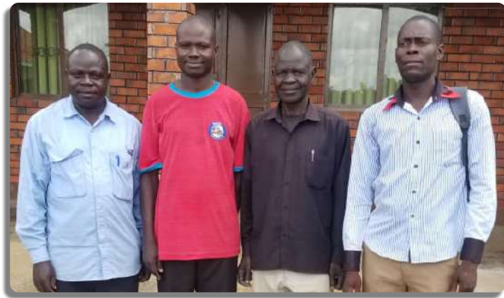
Two Instructors and Two Students Preparing for Travel

A big thanks to all who have supported the Uganda work over the years. The East African School of Biblical studies has been a beacon of light in Uganda since 2003, and so much good work has come from our labors done there. It is only through our joint efforts that we are able to do such great things for the Lord in Uganda, and we will continue to do our best to see that the faithful of Uganda are trained and have an opportunity to receive proper schooling.