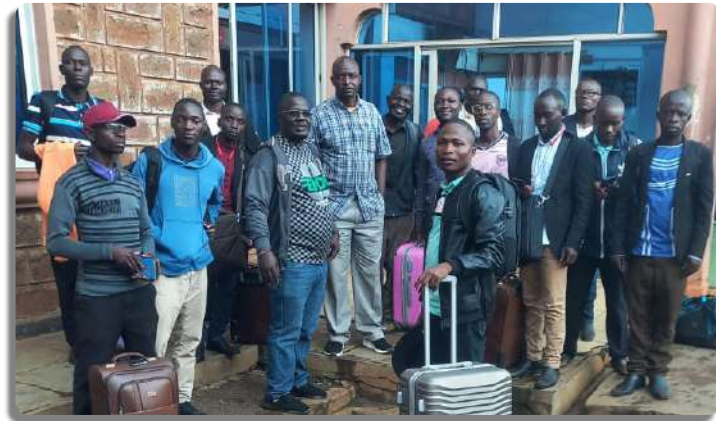
Students and Staff Beginning the Journey