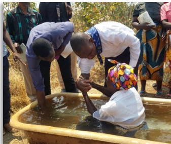
Baptism at Mwanampapa Church of Christ