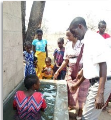
Baptism at Kazungula Church of Christ