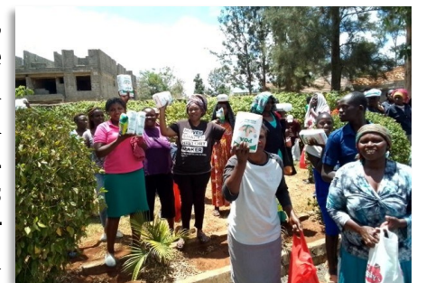
Community Collecting Food

It was a great day, and we were able to help many with their physical and spiritual needs. This day was followed by door knocking with advertisements for the congregation. It was certainly a gesture of goodwill in the community showing the love of Christ. Please pray that this day bears much evangelistic fruit for the new congregation in that area.