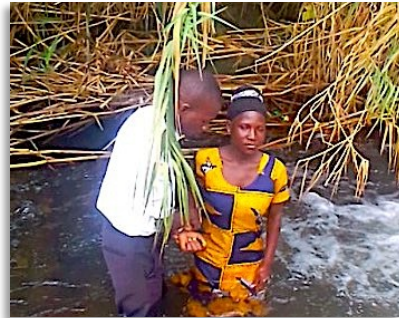
Student Baptizing a Woman

The Lord's work continues in Uganda. Despite the fact that the school is on an extended break. There were some registration problems which forced this break. Our students have been busy using their skills in the work of the Lord. In fact, several have worked to start new congregations and hold Bible studies in their home areas to help others know the saving message of Jesus Christ. There are also two reports of baptisms which we have received in just the last few weeks. Pictured below is one of our graduates in a Bible study at someone's home. It's such a blessing to see 2 Timothy 2:2 playing out in all of these great men. We thank God for these many good efforts taking place to His glory!