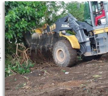
Clearing Ground for the Road

One issue we were able to deal with this past month was that the road which gave access to the school was going through the property of another organization. They built a wall so we were no longer able to pass through their property to access our property. The town council gave us the authority to cut a new road as an easement for our sakes and the sakes of other home owners in the area. So now we have a new road to have direct access to the school from the main highway.