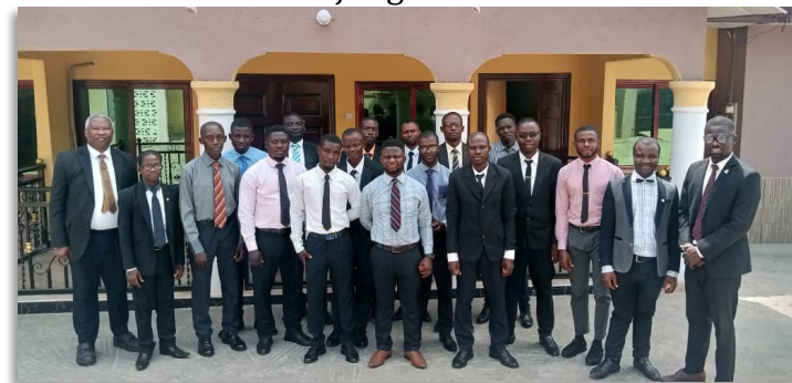
Current Students and Faculty

Our desire is to still consider some sort of building project in Ghana. In the future, we hope to avoid rent payments and give the school a permanent home in the country. Please keep us in prayer as we work toward this major goal.