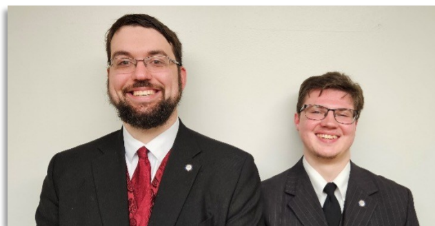
Graduates of BIM 2023