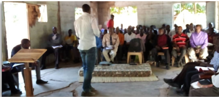
Seminar in Ngwezi

The work continues to go well, and we now have sixteen students who are remaining committed to their studies. We are thankful for them and their diligence to continue learning God's Word.