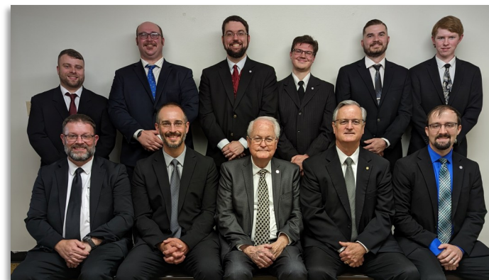
Staff and Students at Graduation

Greetings in the name of Jesus Christ! On May 20 th , we were blessed to have two exceptional students graduate from the Bible Institute of Missouri. In the past few years as we struggled with the Covid pandemic, we experienced fewer men who were willing to start their training. Since beginning in 2003, we have graduated forty-four men who are presently preaching in twelve different states. In August, four students will begin their second year of training, and there are also a few men have expressed a desire to begin their studies. We are thankful to God that we can train faithful preachers of the gospel for the USA.