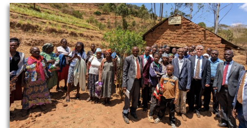
Kola Church of Christ