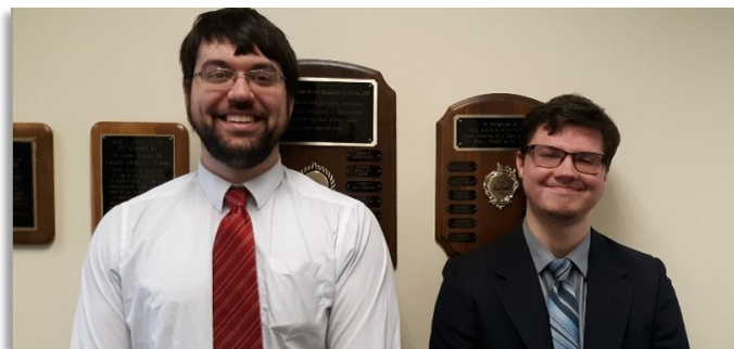
BIM Second Year Students