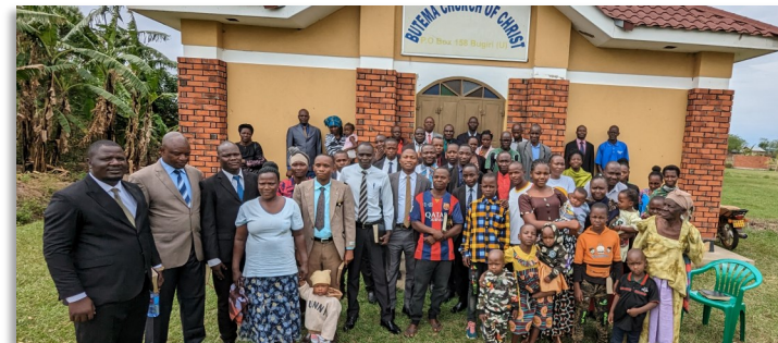
The Butema Church of Christ

On one Sunday we were able to worship with the brethren at the Butema Church of Christ. This is actually the congregation which is located next to the school, and it was established after we built the school there. This school property is located near Busia, Uganda and Kenya-Uganda boarder.