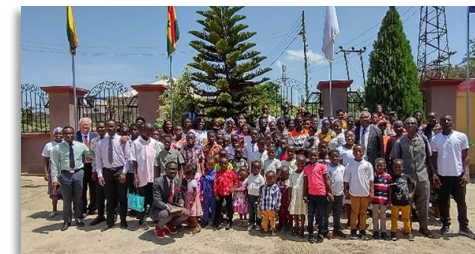
Congregation Which Meets at the School

for His blessings. It's hard to believe but the class below will be graduating in November. If all goes well, I hope to be there for the graduation to celebrate with them. We also are in the continuous process of selecting students for the next intake. Please keep all these plans in your prayers as we do our best to train the faithful men of Ghana to go out and teach others also.