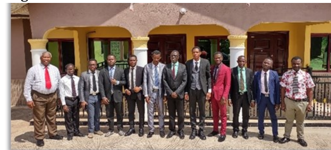
Faculty and Students

for His blessings. It's hard to believe but the class below will be graduating in November. If all goes well, I hope to be there for the graduation to celebrate with them. We also are in the continuous process of selecting students for the next intake. Please keep all these plans in your prayers as we do our best to train the faithful men of Ghana to go out and teach others also.