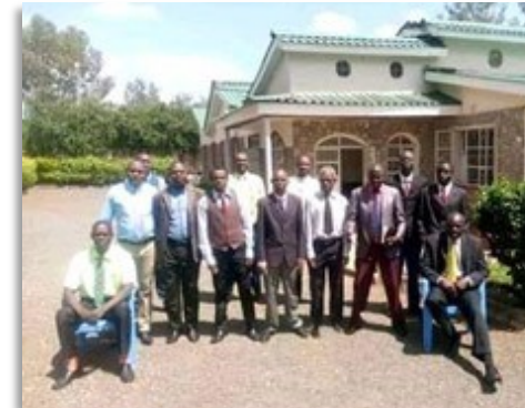
Faculty and Students

The new school in Nairobi Kenya continues to prosper and do well. I think that the faculty and students have finally settled in and that everything is running smoothly in the day-to-day operations of the school.