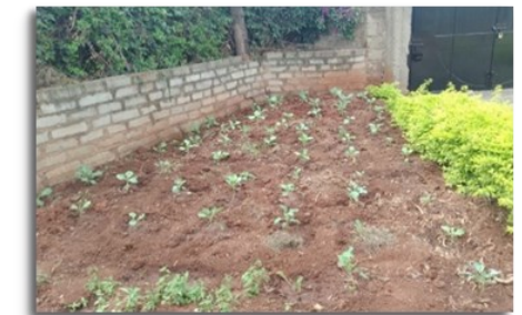
New Garden at the School