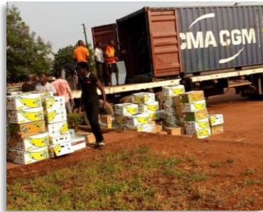
Unloading the Shipment

Just recently, the shipment pictured above arrived in Livingstone, Zambia filled with supplies to be used in Zambia. The shipment was sent by Ron Gilbert, fellow worker in Zambia, Kenya, Uganda and other African countries. The container sent was filled with Bibles, Books, Booklets, Tracts, song books, Bible Correspondence Courses, and some Clothing. It was sent to 4 Preacher Training schools in Zambia. It will greatly supply needed religious materials and Bibles to aid in the spread of the gospel in that country. Our gratitude is extended to brother Gilbert and all the brethren who were involved in helping fulfill a great need.