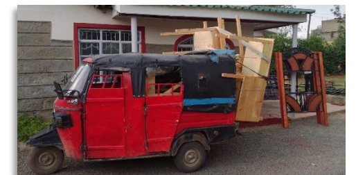
Vehicle delivering the school's furniture

Please enjoy the photos of some of the preparation already being made for the start of the school. My prayer is that God will continue to bless us all as we strive to put Him first and do His will in all things.