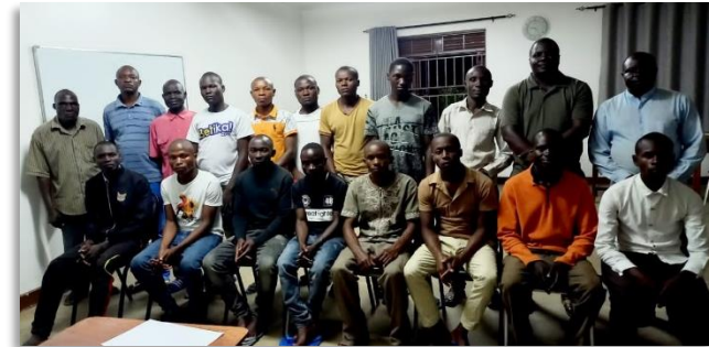
Current Class and staff

After a long struggle from shutdowns and restrictions due to Covid, we were able to graduate the 2021 class and begin the new 2022 class on March 21st.