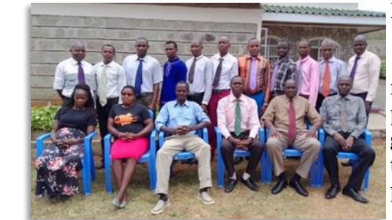
Current Class and Staff

It's hard to believe but our first quarter for the first class in Kenya is coming to a close. After all of the hard work, it is very exciting to see that we now have a school successfully operating in Nairobi, and that we are able to begin making a difference in