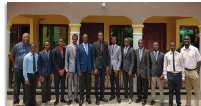
Current Class and Staff

Lord Willing, on April 12th, Dad and I will be headed to Ghana as we continue to play catch-up from the effect of covid on our travels. We will only be in Ghana for a little over a week, but in that time, we can accomplish what is needed and get back home to prepare for the end of the year graduations. We are excited to see our brethren in Aboaso again and know God will bless our way. We are headed to Ghana to encourage our brethren, make sure all is operating well, and deal with any needed issues while there. Please pray for us as we again head to Africa for a safe and successful trip.