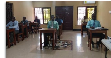
The students in the classroom.

We were also able to pay our rent for the school facility and two of the teachers' homes. Thank you all for helping with these needs. Lord willing, we will someday have our own facility where we will not be burdened with monthly rent needs. Praise be to God for the future of His work in Ghana continues to look great.