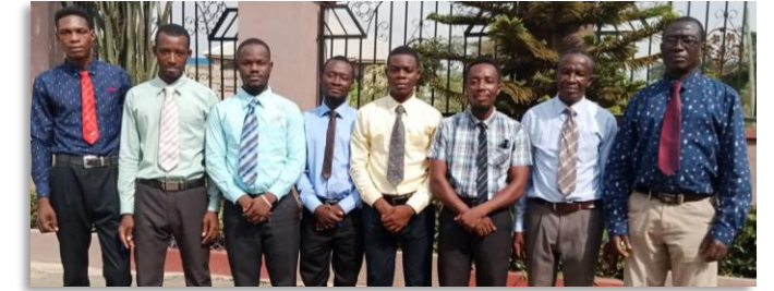
Third Class of the MIBSG