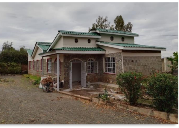
New Kenya Preaching School Facility