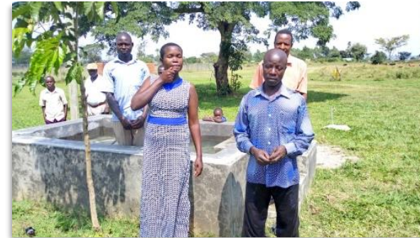
New Brethren in Uganda

The picture above is an example of why we are in Uganda striving to commit the Word of God to faithful men who will lead the lost to Christ. More than likely the couple you see in the picture would have never heard the truth unless one of our trained preachers met them and lead them to obedience. This new brother and sister will be worshipping with the Butema church of Christ located close to EASOBS.