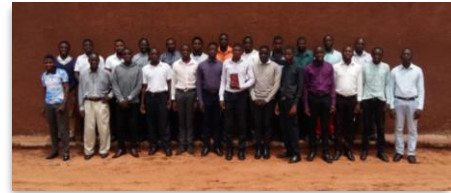
Zambia Class of 2022

The new class of 26 students just began in February of this year. According to reports