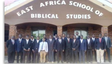
Uganda Class of 2021

The picture to the left is the present class that is now in session at EASOBS. The sixteen men have returned